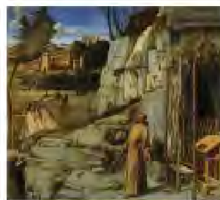
Image: St. Francis in the Desert Giovanni Bellini (Italian, ca. 1434/35-1516)