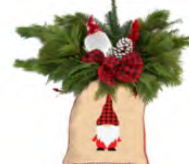
HANGING GREENERY BOUGH