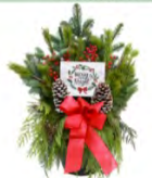
OUTDOOR GREENERY ARRANGEMENT