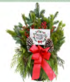
OUTDOOR GREENERY ARRANGEMENT