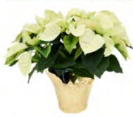
6.5" PREMIUM POINSETTIA