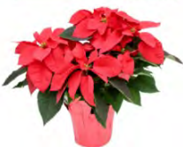
6.5" PREMIUM POINSETTIA

Note: Our online website also accepts credit card or you can select the PayPal.me option and use the same PayPal account you are using for HSA Hot Lunch Program. Feel free to email us if you have any questions. Contact information located at the TOP RIGHT corner of this website. Thank you for your support!