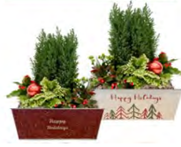
INDOOR TROPICAL PLANTER