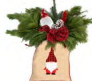
HANGING GREENERY BOUGH